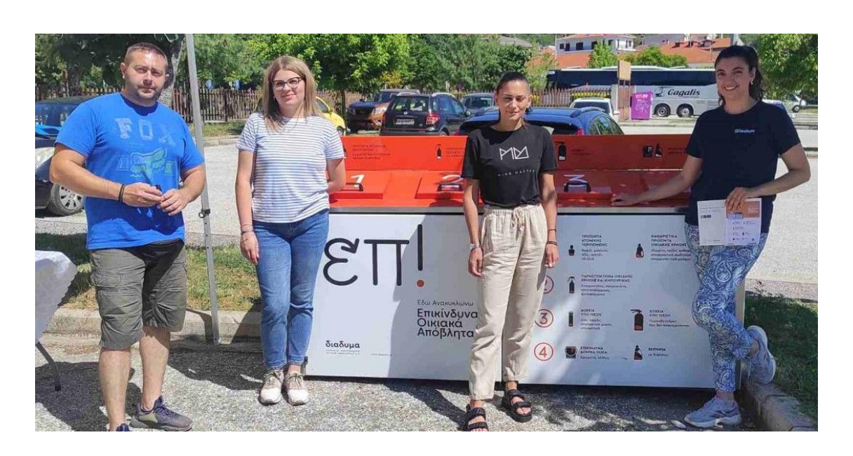
in the cities/towns of Kozani, Florina, Grevena, Kastoria, Siatista, Amyntaio, Nestorio and Prespes.

View here an information site dedicated on HHW, created by DIADYMA SA (in Greek): https://eoa.diadyma.gr/