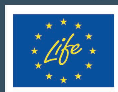
The LIFE Programme of the European Union